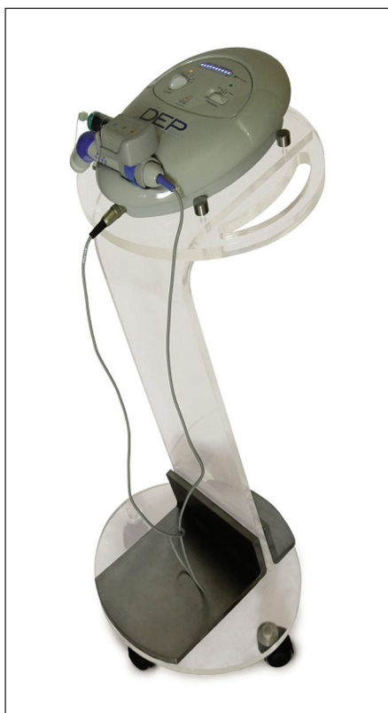
Figure 2: The Dermoelctroportation® (DEP) System and Mobile Stand.

stances like non-crosslinked hyaluronic acid, in conjunction with a microdermabrasion treatment. The microdermabrasion treatment is a standard in cosmetic dermatology and it is needed in order to have the assurance that the stratum corneum has a maximum permeability so that that the drug is really transdermally delivered.