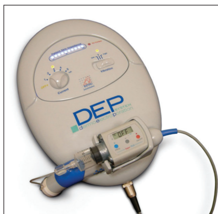
Figure 1: The Dermoelectroporation® (DEP) System.

The device is covered by a broad US patent estate, which includes US patent numbers: 6518538; 6535761; 6587730; 6687537; 6743215; 6748266; 6980854; 7010343;