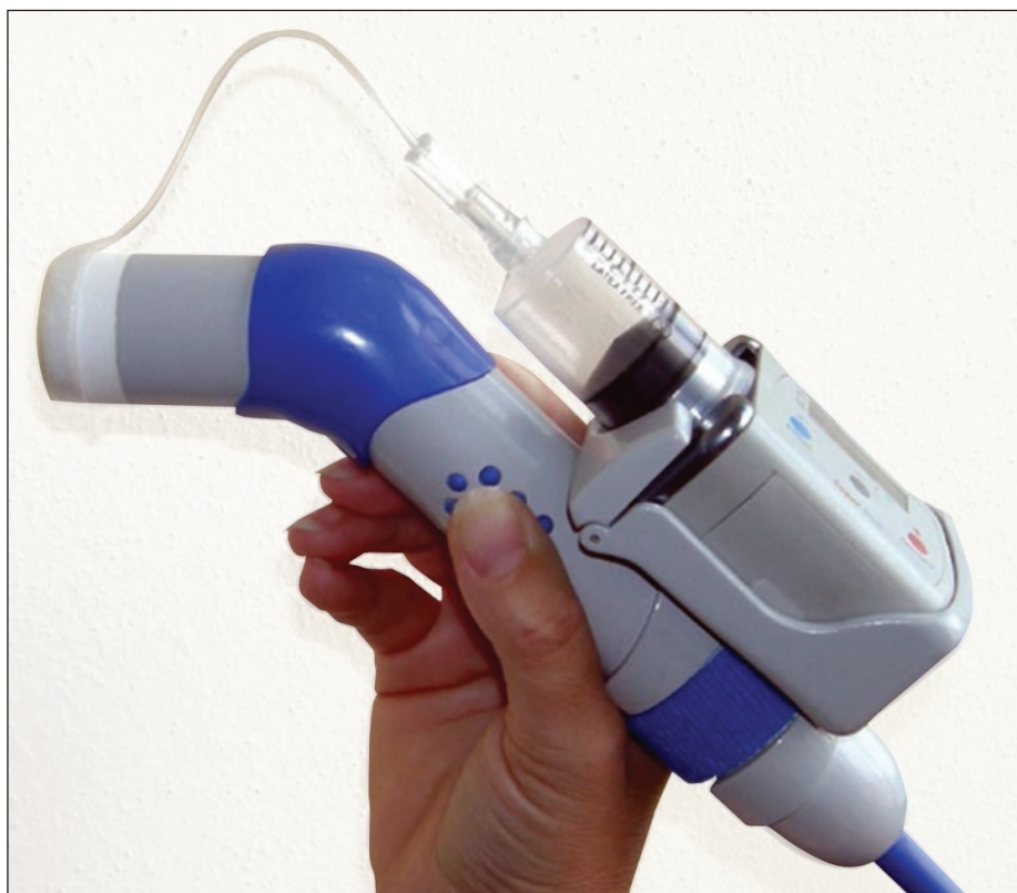
Figure 3: On the DEP handpiece is mounted an optional computerised liquid dispenser that delivers the drug to the disposable cap by pushing a disposable drug-loaded syringe.

Recently, in order to broaden the use of the technology, a means to verify sufficient stratum